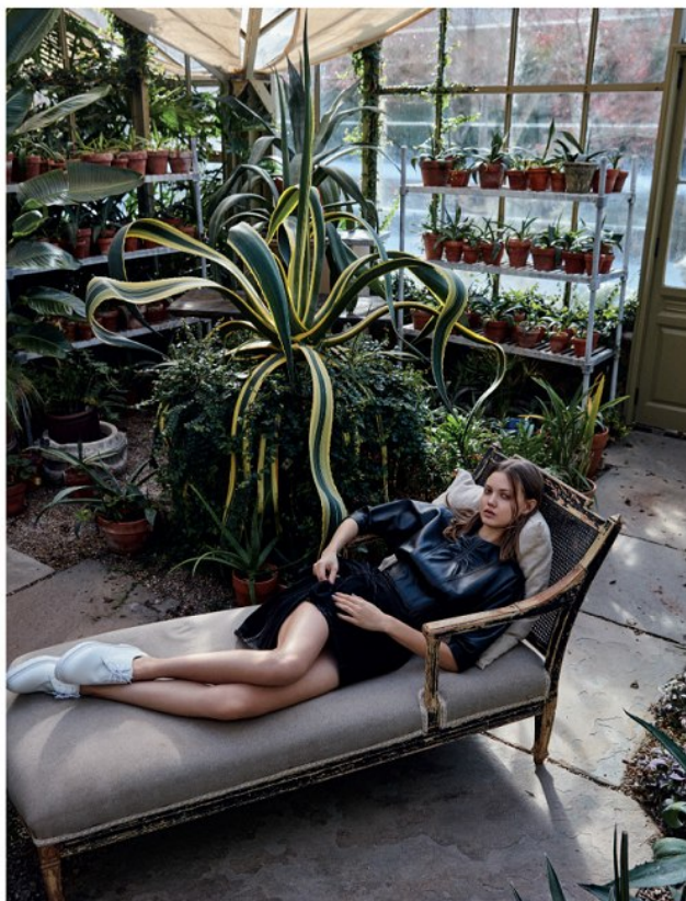
top and skirt Miu Miu shoes Dr. Martens