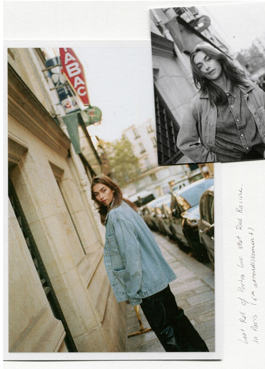
Last Roll of Portia Leo shot Rue Racine, in Paris (6 th arrondissement)