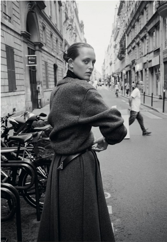
Pullover aus Wolle und Kaschmir, Midi-Faltenjupe aus Mohair, Gürtel aus Leder, alles von PRADA. Rollkragenpullover privat