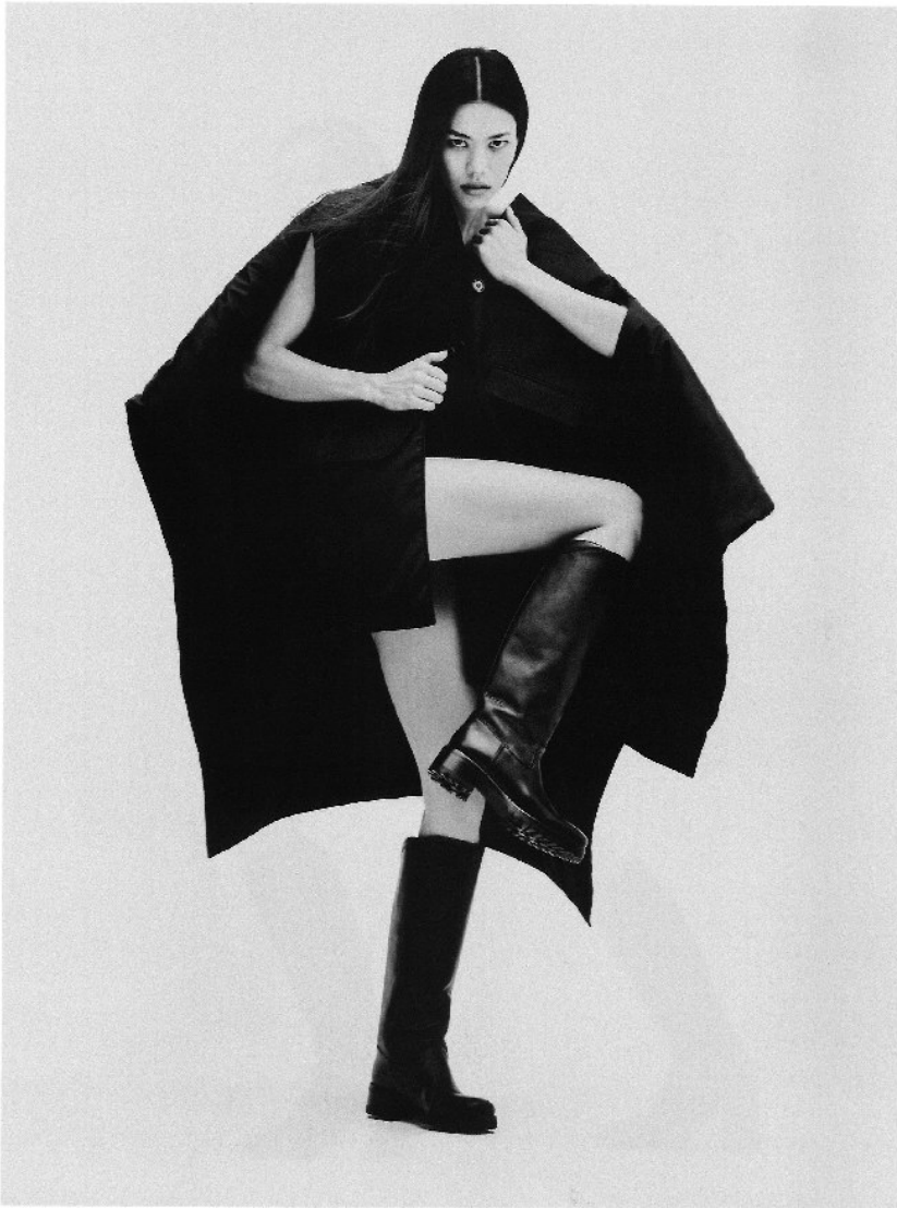
Cape en laine et Nylon, BURBERRY. Bottes, FREE LANCE.