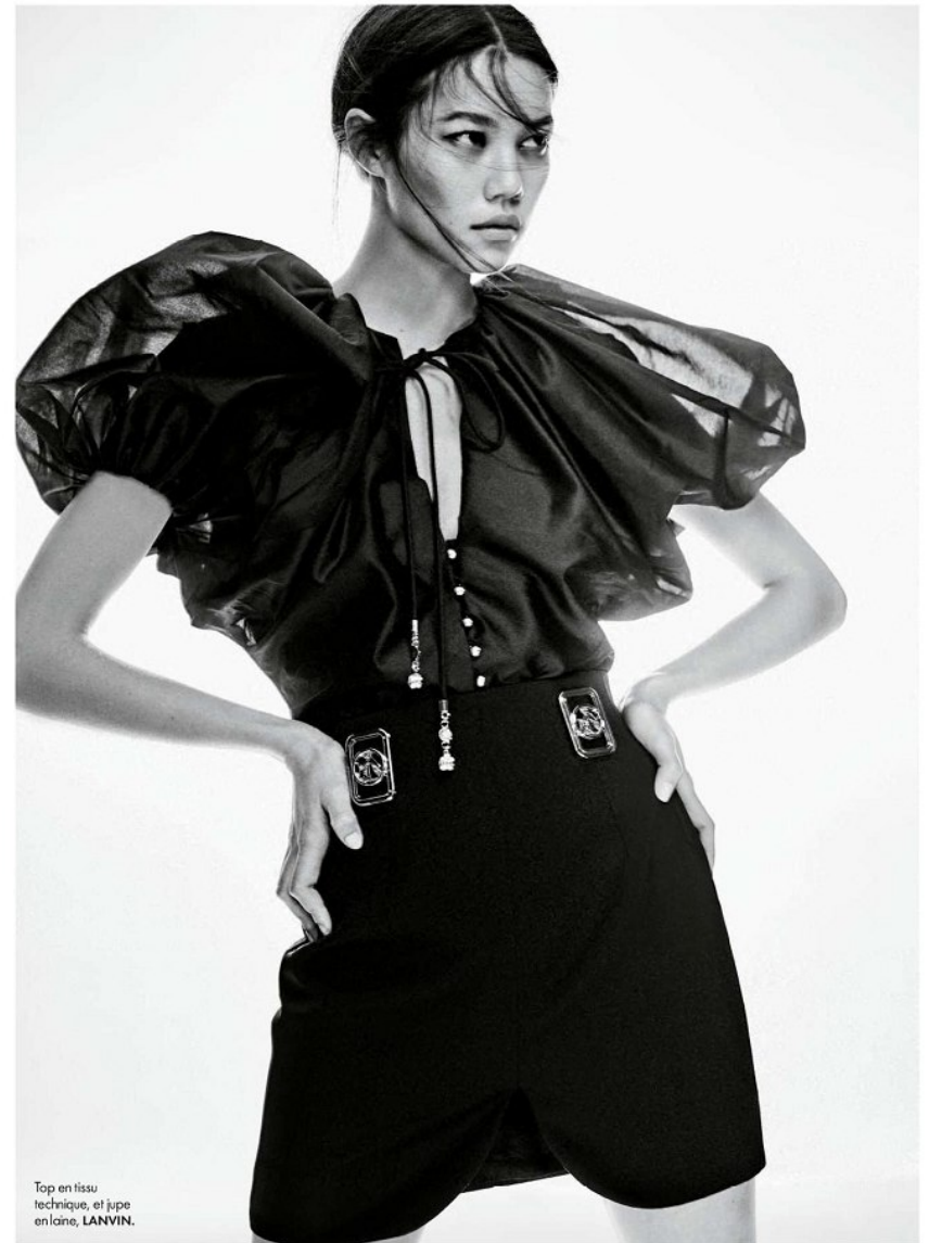
Top en tissu technique, et jupe en laine, LANVIN.