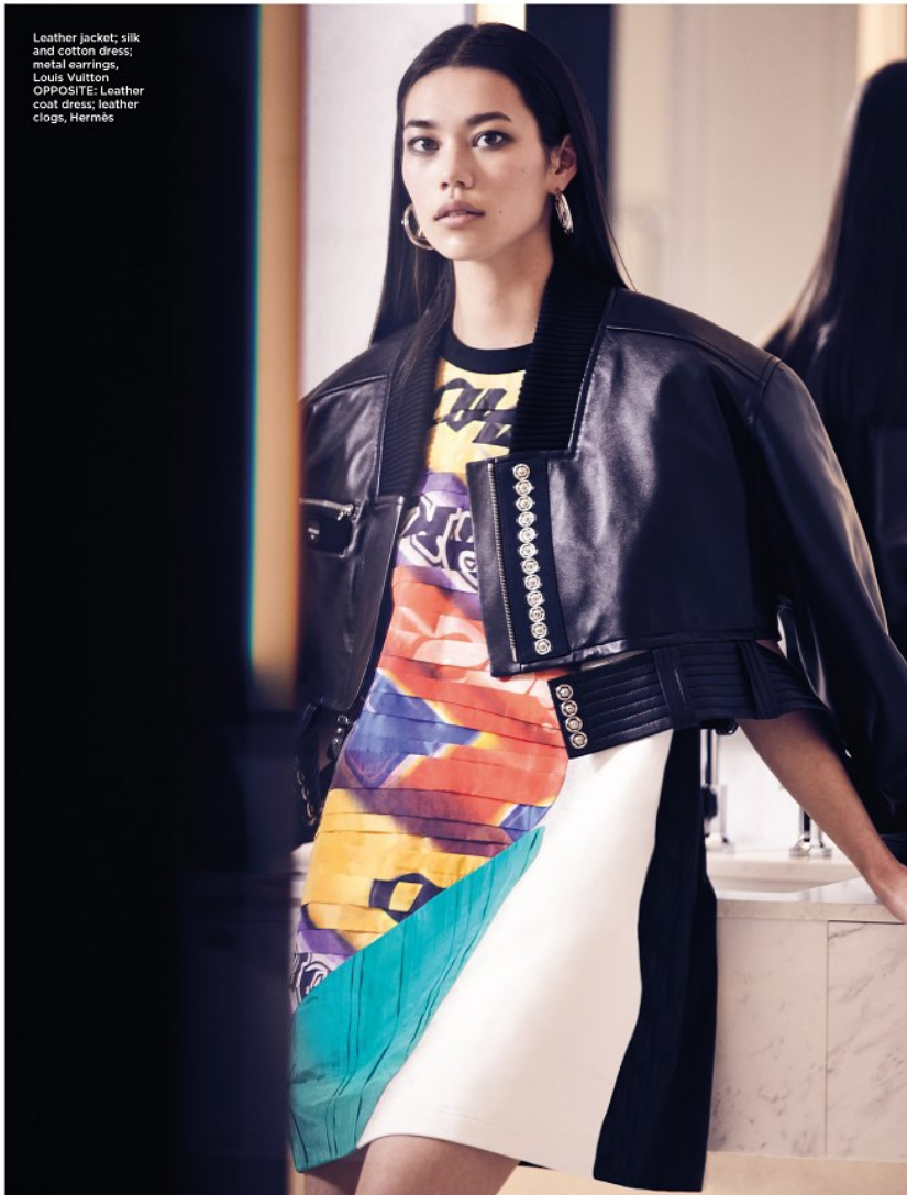
Leather jacket: silk and cotton dress; metal earrings, Louis Vuitton OPPOSITE: Leather coat dress; leather clogs, Hermès