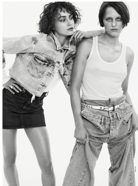
anm.com No. 15/2022