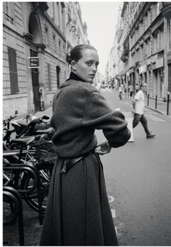
Pullover aus Wolle und Kaschmir; Mid-Faltenjuppe aus Mohair; Gürtel aus Leder, alles von PRADA. Rollerjuppenpullover privat