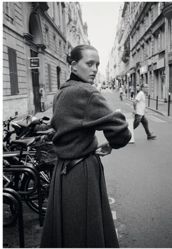
Pullover aus Wolle und Kaschmir; Mid-Faltenjuppe aus Mohair; Gürtel aus Leder, alles von PRADA. Kollagenpullover privat