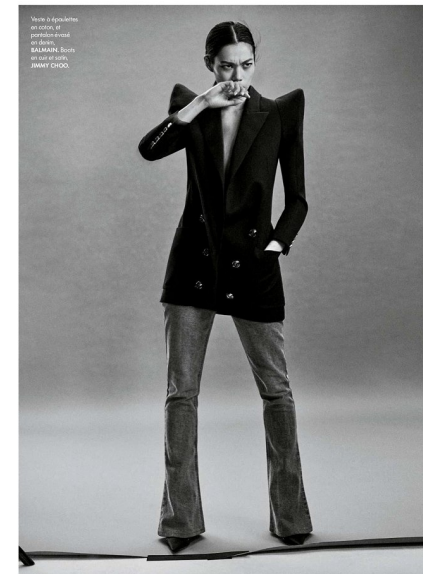
Veste à épaulettes en tulle, et pantalons en tulle, BALENZA. Bouton en cuir de tigre, JIMMY CHOO.