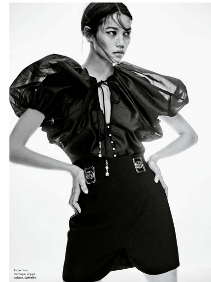
Top en tulle technique, et jupe en tulle, LANVIN.