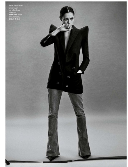
Veste à épaulettes en tulle, et pantalons en tulle, BALENZA. Boots en cuir de tulle, JIMMY CHOO.