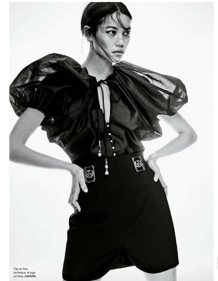
Top en tulle technique, et jupe en tulle, LANVIN.