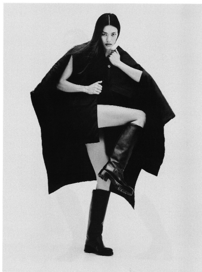
Cape en laine et Nylon, BURBERRY. Bottes, FREE LANCE.