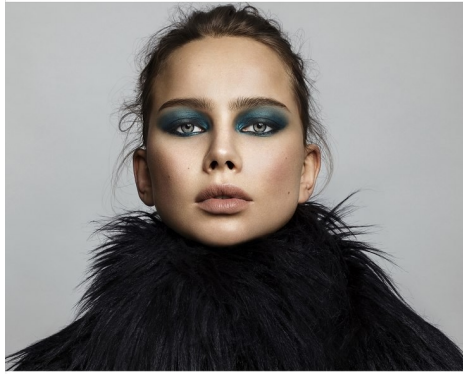
Face: Love Flush in Love Hammer, TOO FACED, Eyes: Eye Color Quad in 191 Printer Kill and 192 Blue Lagoon, CLÉ DE PEAU BEAUTÉ, Lip: Matte Revolution Espalck in Matte 1993, URBAN DÉCAY. Opposite page: Face: Cachouze Foundation in Ombre Nude No. 22, BE BEAUTY BEAUTY, Powder Blush Duo in 1992 Blush Bliss, Browing Powder Duo in 191, CLÉ DE PEAU BEAUTÉ, Eye: Eye Color Quad in 191 Printer Kill, CLÉ DE PEAU BEAUTÉ, Argel d'Or in 191, L'ARABESQUE, Just Brandy's Brandy the Singing Brandy in Deep Brown, CLANQUE, Lip: Lip Perfekt in Amarrin Noir, LAURAMERCIER.