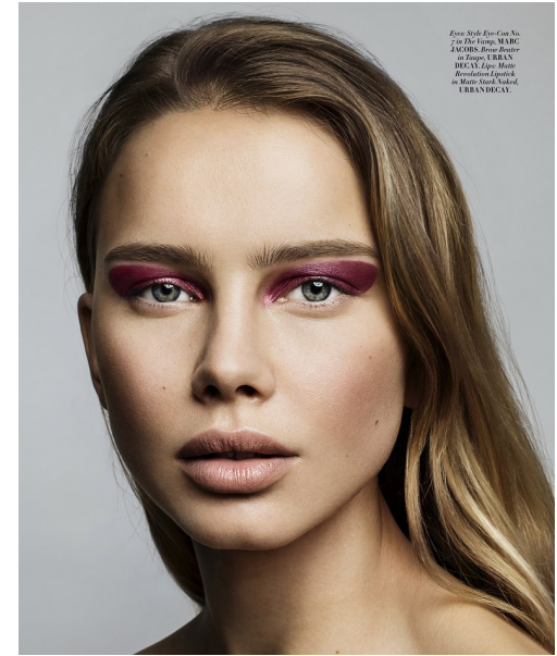
Stylist: The Agency, M&C Hair: M&C, Makeup: Anm in Toronto, URBAN DRESS, Lip: M&C Revlonista Lipstick in Matte Shade, Nails: URBAN DECAY